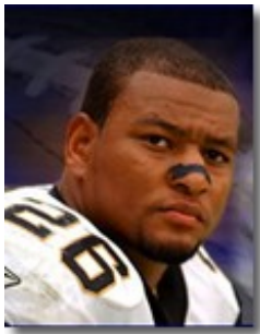
Deuce McAllister sponsored by SUDIA

Join Deuce as he presents information relating to background on his NFL experience, school milk and the importance of milk to children, the "Fuel Up To Play 60" NFL program and SUDIA's involvement and the importance of maintain a relationship with your SUDIA contact.